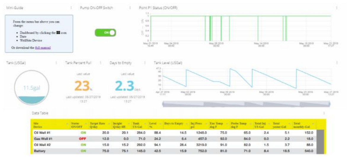
Figure 7: InSight Connect dashboard

In many cases, data access and data security can be a barrier to widespread adoption of these systems. For example, in cases where an oil and gas production company are monitoring and controlling the complete injection system , and a third-party chemical provider requires access only to the chemical tank measurement to monitor chemical inventory and manage chemical deliveries, many oil and gas companies may deny this third-party access for network security reasons. A solution to this issue is to split the data stream at the device level, connecting the device to a SCADA network for full control by the oil and gas operator, and then providing chemical tank monitoring to the chemical provider through a separate, independent IIOT gateway.