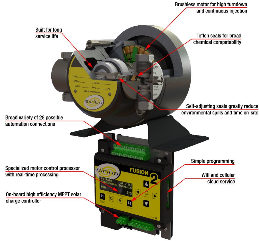
Figure 2: Smart pump, motor, and controller

With the goal of digitization in mind, it cannot be stressed enough to ensure that a smart pump (pump/motor/controller) is included as part of new system design (Figure 2). For