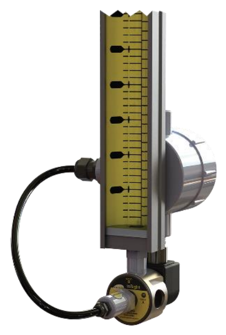
Figure 6: Smart sight glass

New technology like the Smart Sight Glass depicted in Figure 6 addresses these limitations and combines both tank level measurement and instantaneous fluid rate measurement in one intelligent device.