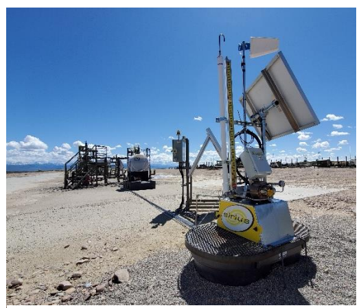
Figure 1: Digital Chemical Management

Digital technology and smart devices have fundamentally changed the way that we manage our lives. These advances are not limited to smart phones or consumer devices and are now greatly improving operational efficiency in the chemical management sector of the oil and gas industry.